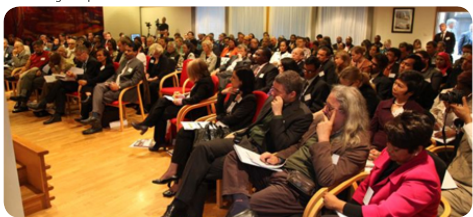
Participants at the Oslo Governance Forum, which gathered close to 250 practitioners, policy experts and leaders representing government, civil society, academia and international organizations.