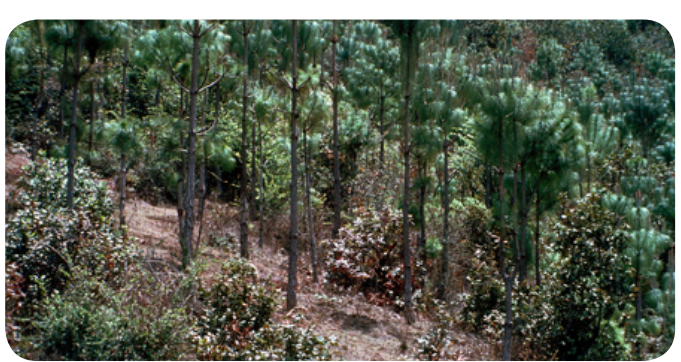
A reforestation project in Chiapas, Mexico

other important variables, such as biodiversity and social impacts, particularly in the context of the growing awareness of the importance of safeguards, were also considered. In addition, the promotion of community monitoring, to overcome the