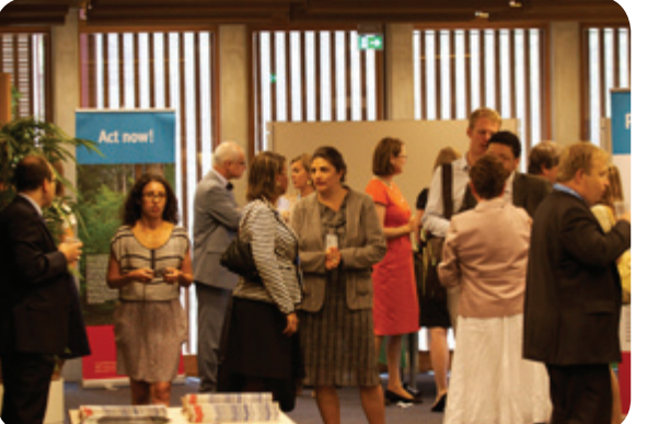
Representatives of permanent missions to the UN in Geneva, NGOs and UN-REDD Programme partners gather for the UN-REDD Programme briefing, which took place in Geneva 9 May.

"By focusing on good governance, forest monitoring, ecosystem services, stakeholder engagement, equitable sharing of benefits and gender equality, the UN-REDD Programme is uniquely placed to support governments in planning and implementing national strategies for REDD+",