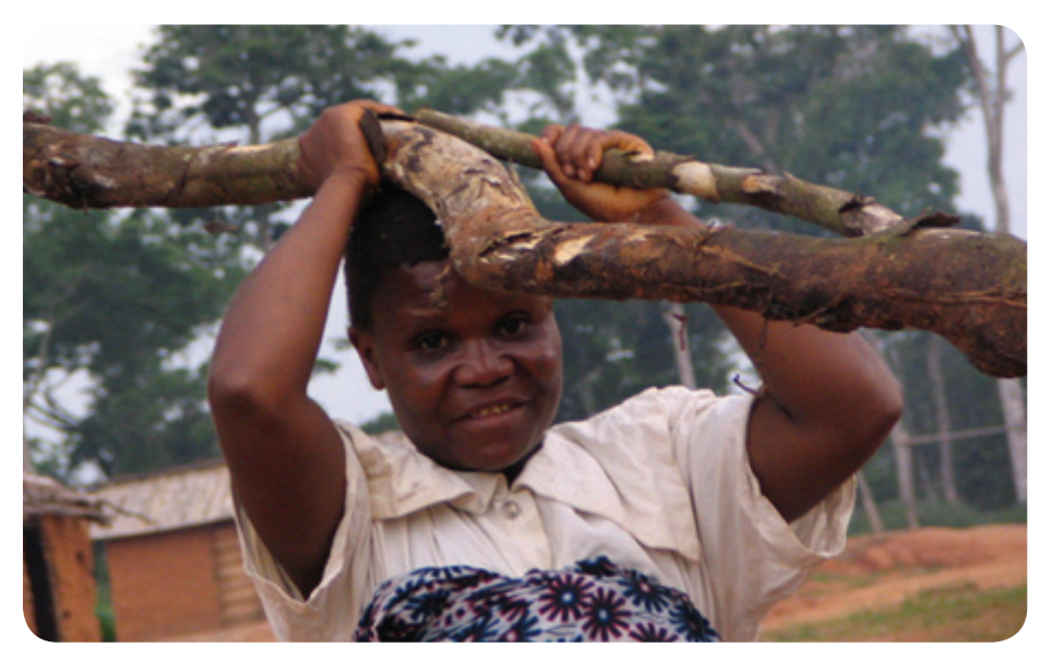
In the Ituri Forest community, Biakato Village, Western Province

Engaging civil society organizations and indigenous peoples can be a complex process, especially in countries where relationships have been tense in the past. The Democratic Republic of the Congo, which has now initiated implementing its readiness activities with support of the UN-REDD Programme, has been able to bridge the gaps.