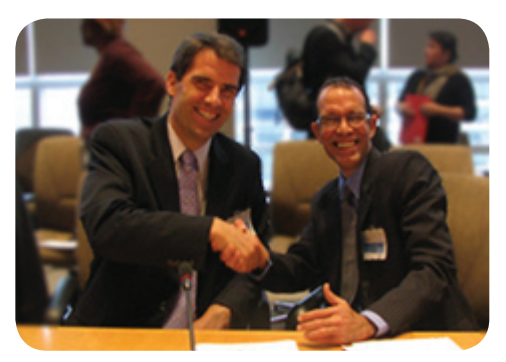
The UN-REDD Programme's third Policy Board approved funding for Panama's national programme

Argentina, Cambodia, Ecuador, Nepal and Sri Lanka join the UN-REDD Programme, Denmark becomes a donor and Panama gets approval of its UN-REDD national programme