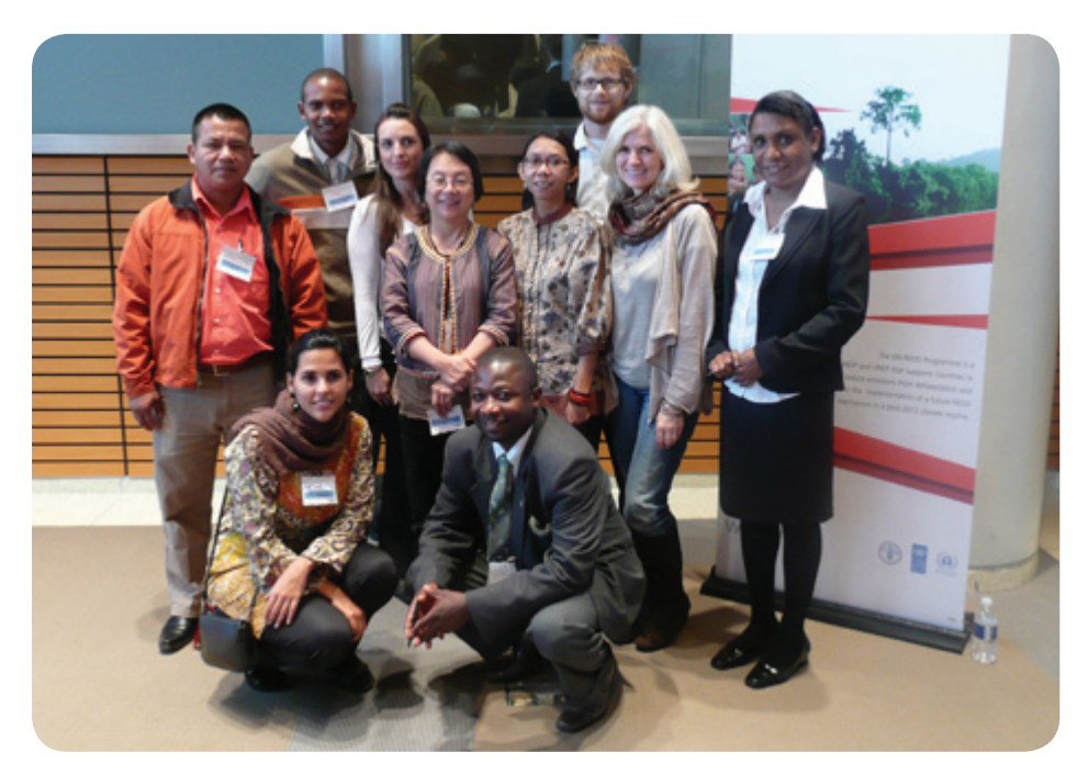
Newly selected representatives of civil society and indigenous peoples participated in the third UN-REDD Policy Board meeting

The self-selection process has now been concluded and four representatives have been elected, representing four regions of the world