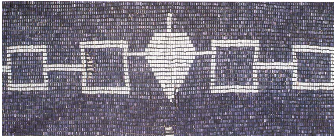
The 'Hiawatha Wampum belt' symbolised the founding of the Five (later Six) Nations Confederacy

The interactions between the French and the Algonquians were far from perfect. Disputes often arose, notably over the traders' relations with Indian women, specific exchanges, debts, and personal violence, frequently fuelled by the cheap liquor which was an integral part of the trade. An essential element of the Middle Ground was thus the mutual acceptance of means of dispute settlement. The French system of justice, in which retribution for crimes required that individual criminals be punished by the State, fitted ill with the indigenous notion that misdemeanours should be paid for by the group, which had collective responsibility for them. In the Middle Ground, the French acceded to the indigenous notion of collective payment for crimes, while the Algonquians accepted that, for the French to feel that justice had been done, individual perpetrators had to be seen to be punished. With honour satisfied on both sides, disputes could be resolved without recourse to warfare. 11