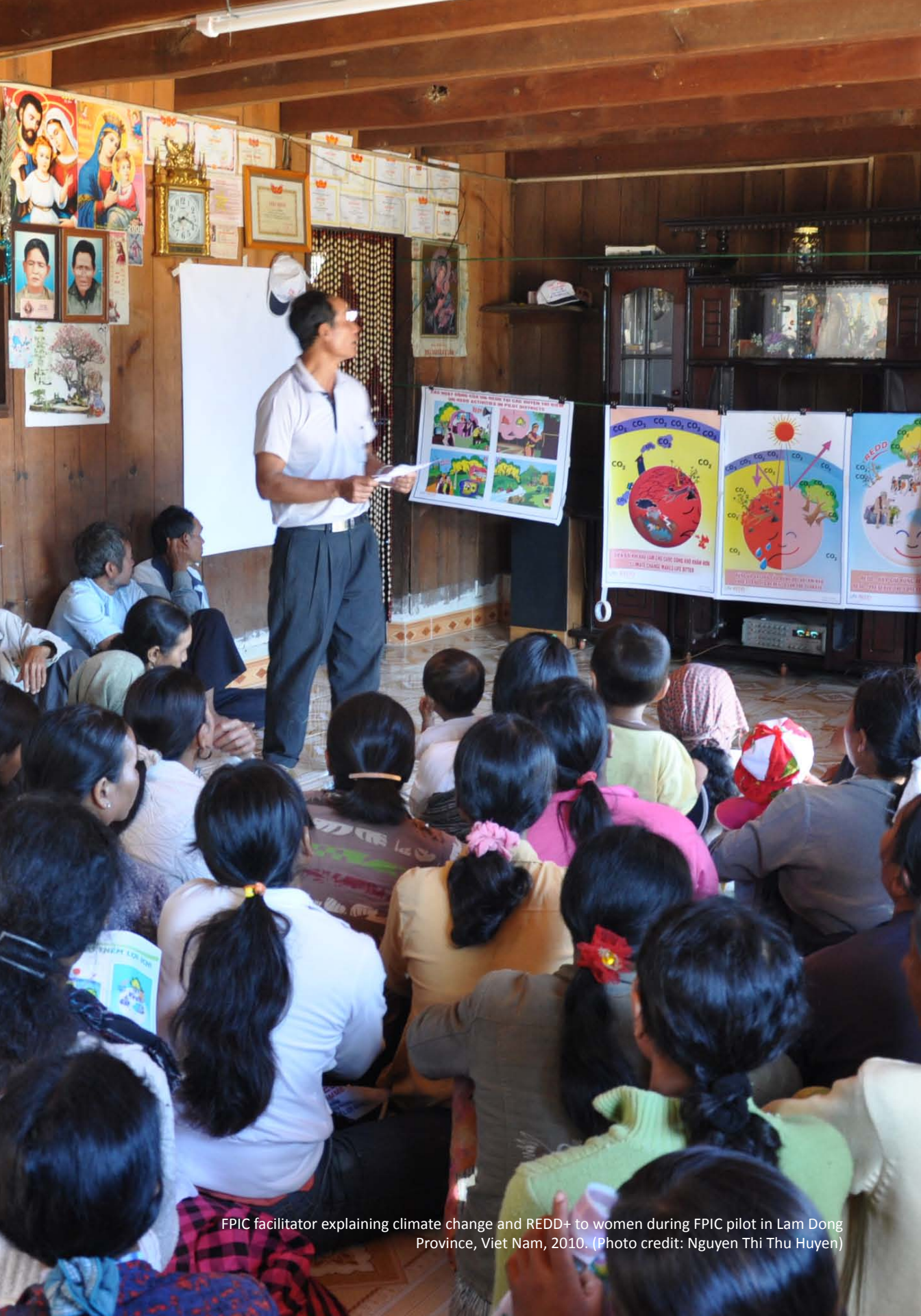
FPIC facilitator explaining climate change and REDD+ to women during FPIC pilot in Lam Dong Province, Viet Nam, 2010.