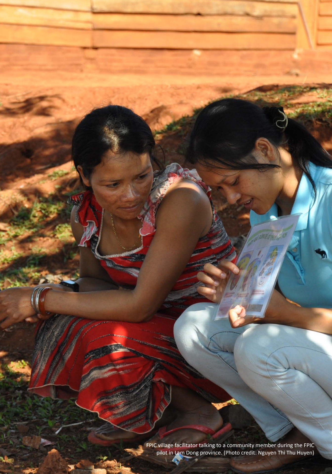
FPIC village facilitator talking to a community member during the FPIC pilot in Lam Dong province.