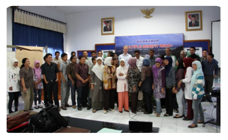
Participants of the Multiple Benefits workshop

By involving many different stakeholders in the ongoing REDD+ process, the UN-REDD National Programme created a supportive environment for REDD+ in Central Sulawesi.