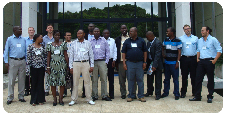
The Zambian and Tanzanian delegations at the UN-REDD-INPE training course.

INPE's technology to support their Amazonia monitoring systems is composed of different operational and complementary projects which are mentioned above: DETER, DEGRAD, DETEX and PRODES. The Brazilian system is the largest and most robust operating forest monitoring system in the world and has been providing official annual rates of gross deforestation to the Brazilian government since the late 80s. Monthly information on forest cover changes in Amazonia has been provided to the government control and enforcement agency since 2004, allowing early measures to be taken to prevent further non-authorized deforestation activities. As open source products, DETER, DETEX, DEGRAD, PRODES and TerraClass are distributed free of charge, as all available INPE data. ■