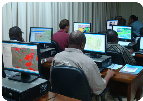
Hands-on training on remote sensing at INPE's training centre in, Belém, Brazil.

This first UN-REDD-INPE training in 2012 aimed at improving the knowledge on the use of remote sensing (RS), information technology (IT) and modeling aspects of a satellite forest monitoring system. The knowledge gained will be valuable to expand monitoring of the entire national territory, which may become relevant for Greenhouse gas (GHG) inventories related to Land Use, Land-Use Change and Forestry (LULUCF) or Agriculture, Forestry and Other Land Use (AFOLU). The training targeted country-level technical experts from Tanzania and Zambia including computer science experts as well as GIS forest experts responsible for the implementation of REDD+ and national forest inventory for national governments.