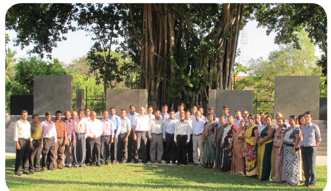
Participants representing a wide range of stakeholders attended the Sri Lanka National Readiness Preparation Proposal (R-PP) Review Workshop in January.

received an invitation in July 2011 by the UN-REDD Programme Secretariat to prepare the R-PP, and proposed management arrangements for the R-PP implementation. This was followed by the focused group