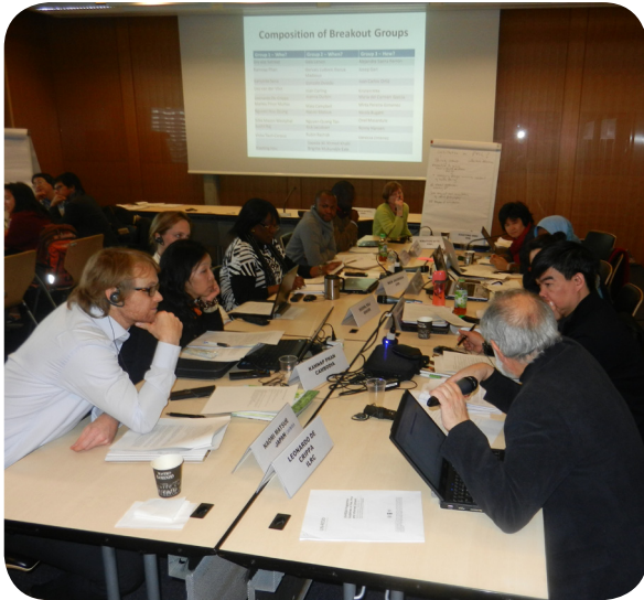
Participants to the recent SEPC and FPIC workshops in Geneva included representatives from UN-REDD Programme donor and partner countries, as well as national and international Indigenous Peoples' and civil society organizations.

Available materials include background documents, agendas and participants lists, formal presentations and copies of breakout group presentations. ■