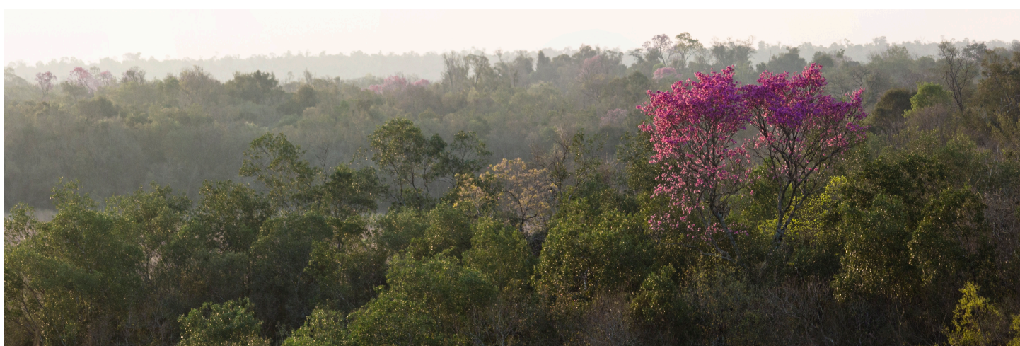
Paraguay's forests provide a range of important ecosystem services, which are threatened by deforestation and forest degradation.

An important additional criterion in REDD+ planning will be the relative costs of different actions. Information on the implementation costs of REDD+ actions, in combination with spatial information on the distribution of benefits and risks, can help decision-makers to design cost-effective REDD+ implementation plans. Work on opportunity costs can contribute to an overview of land value, to help consider potential gains from REDD+ actions in comparison with alternative land uses.