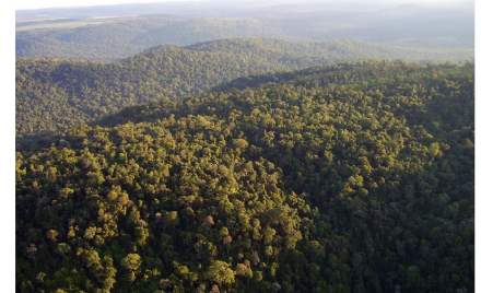
In addition to their role as carbon stores, Paraguay's forests provide social and environmental benefits.