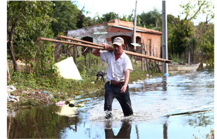
Deforestation reduces the capacity of soil to retain water, which may cause soil erosion and make parts of Paraguay more prone to flooding.

Data sources: Hijmans (2005), GWSP Digital Water Atlas (2008), Lehner et al. (2008), PNC ONU-REDD+ Paraguay (2011), Saatchi et al. (2011), Birdlife and Conservation International (2012), IUCN Red List of Threatened Species (2013), CATIE (2014), IABIN Dams of Paraguay compiled by TNC. For a full method description, please see: Walcott, J. et al. (2015). Mapping multiple benefits of REDD+ in Paraguay: using spatial information to support land-use planning . Cambridge, UK: UNEP-WCMC. Available online at http://bit.ly/paraguaymultiplebenefits