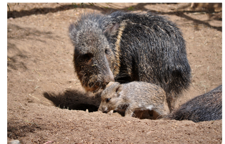
Both the Chaco and east of Paraguay harbour species of regional and global importance, which are threatened by deforestation.