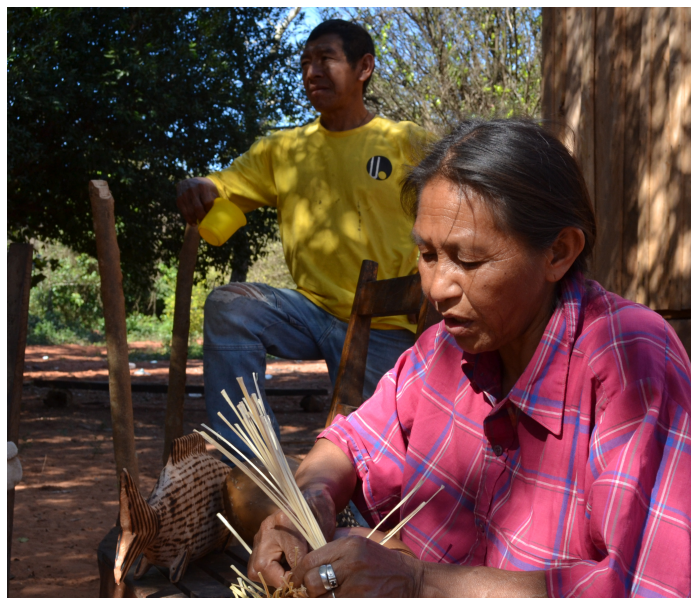
REDD+ actions can help to deliver social and environmental benefits beyond climate change mitigation alone.

Spatial analysis can support the development of national strategies and implementation plans for REDD+. By helping to identify