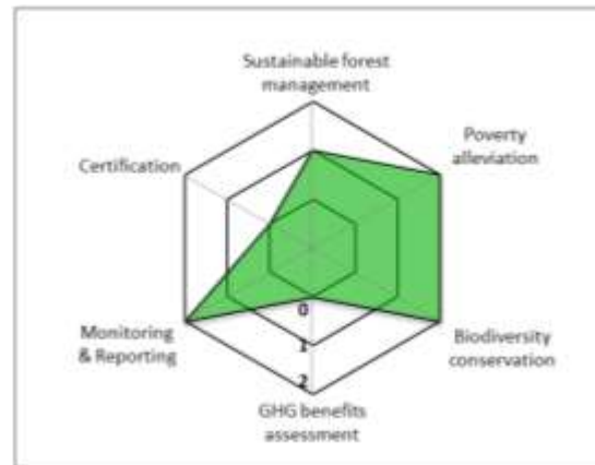
CCBA REDD S&E