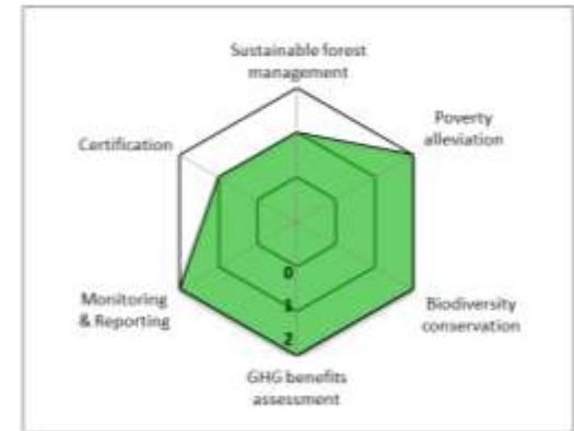
Global Conservation Standard