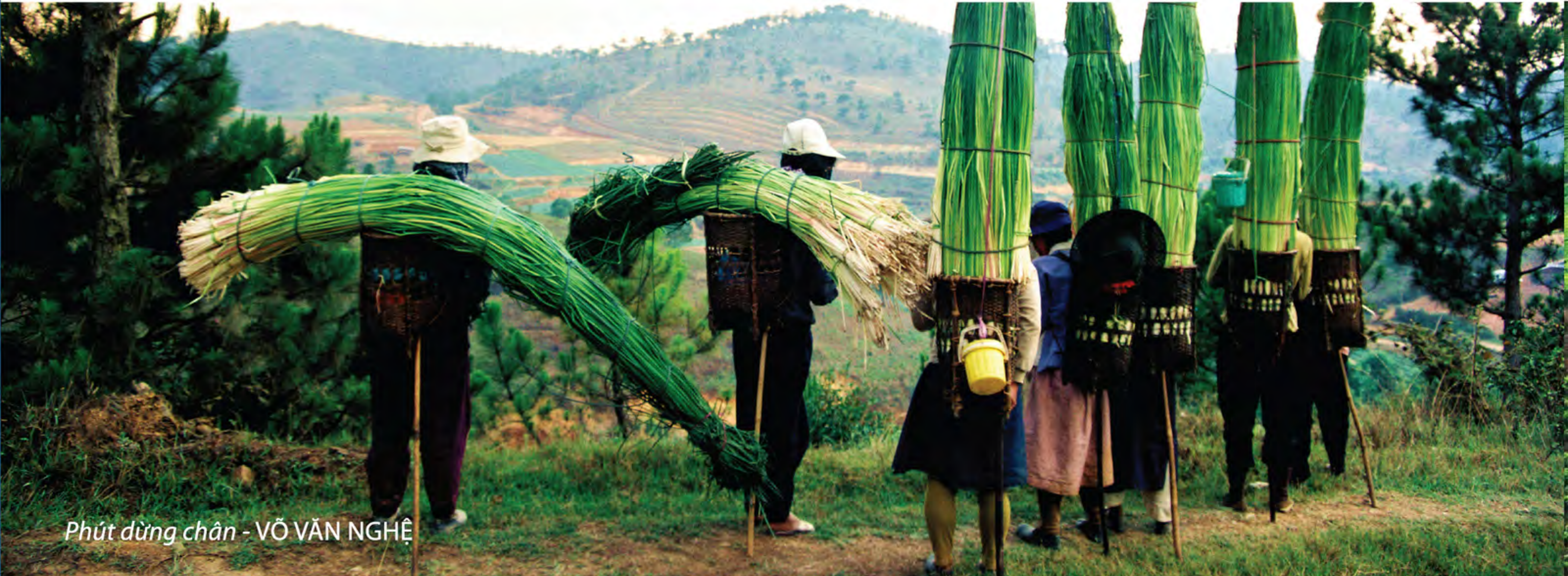
Phút dừng chân - VÕ VĂN NGHỆ