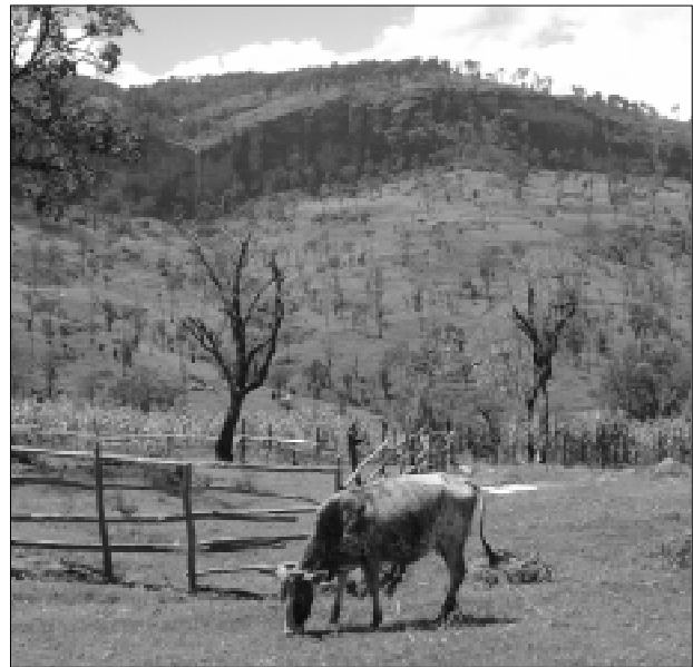
Figure 9. Border of Mt. Elgon National Park, showing relic trees left on farmland.

In some situations, policies preclude the participation of local people in the management of natural resources. The reforestation project in Uganda described in Box 7 demonstrates the consequences of ignoring the interests of local people.