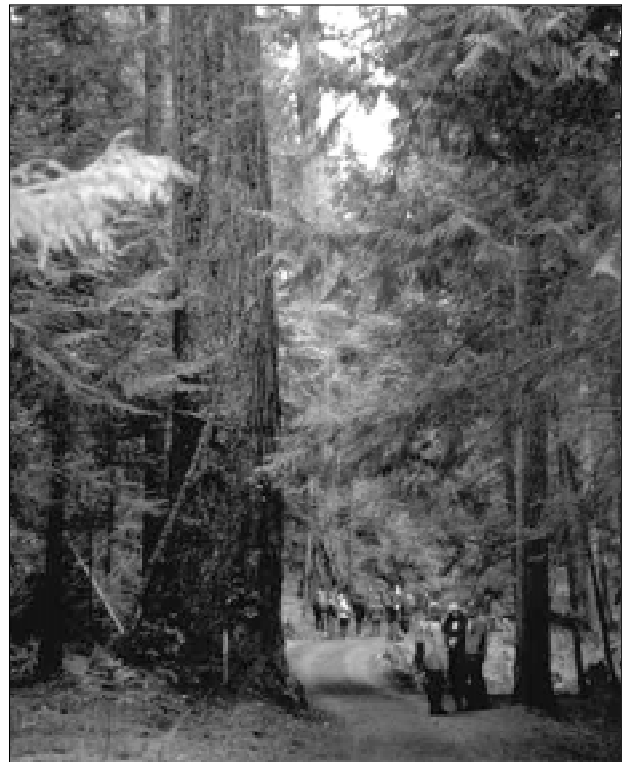
Figure 13. Forestry and land-use activities can help to achieve reductions in greenhouse gas emissions while providing opportunities to improve both environmental and social conditions.

Social and environmental safeguards, including measures for alien invasive species, can ensure that the new interest in carbon sequestration does not overwhelm existing priorities for environmental management, income generation and poverty alleviation. Stakeholder consultations should be carried out to gather information and promote public acceptance of new policy initiatives. A framework for monitoring and evaluating the environmental and socio-economic effects of carbon sequestration projects is another valuable public policy tool for ensuring that forestry and land-use activities and projects are environmentally sound and socially equitable.