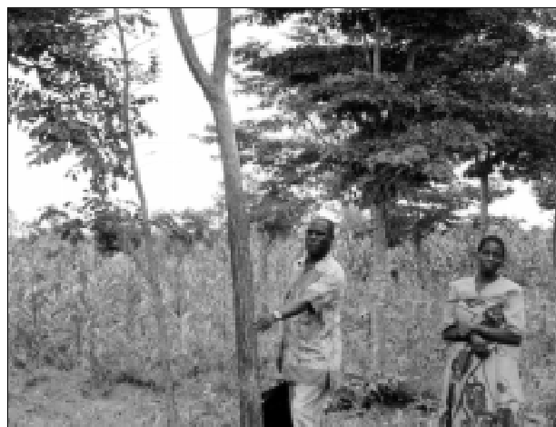
Figure 7. Restored trees on farmland in the Shinyanga region, Tanzania.

in past years because of questions about ownership rights over trees and use of private land. More sophisticated and site-specific forms of agro-forestry are now in place, providing new incentives that may overcome this resistance.