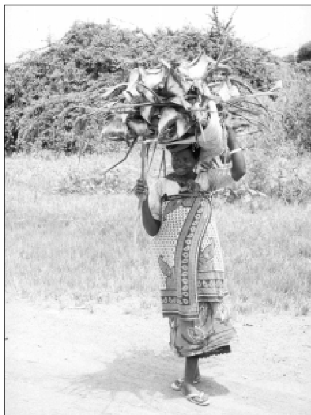
Figure 12. Non-timber forest products being collected from restored woodlands (ngitili) in Shinyanga Region, Tanzania.

Despite these problems, this approach may have merit in the context of afforestation and reforestation projects under the CDM. In combination with a process-oriented approach, some basic safeguards can be developed that identify vulnerable social groups and natural environments and indicate which measures affect them.