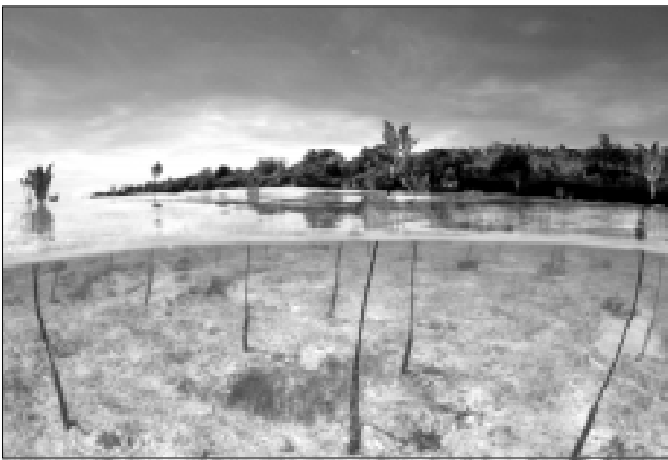
Figure 8. Mangrove reforestation, Philippines.

Box 5 described how agro-forestry is being used in Mexico to encourage carbon sequestration. Projects in Nigeria, Cape Verde and Ghana, included in the best practices databank developed by UNEP and in the World Agroforestry Centre (ICRAF), also demonstrate how agro-forestry can be used to control land degradation and reduce poverty.