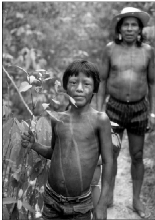
Figure 1. Two Kayapo Indians on a trail bordered by medicinal plants in tropical rainforest, Amazonia National Park, Parà, Brazil.

Parties to the UNFCCC are guided by the principle that forestry and land-use activities should contribute to biodiversity conservation and the sustainable use of natural resources. 3 They are also requested to abide by commitments under the Convention on Biological Diversity (CBD) and other relevant international environmental agreements related to sustainable forest management and agriculture. 4 They are further expected to minimise environmental degradation resulting from forestry and land-use activities through the use of strategies such as impact assessments. 5 Many international organisations, including IUCN – The World Conservation Union and the United Nations Environment Programme (UNEP), have highlighted the need for forestry and land-use activities administered under the Kyoto Protocol to be environmentally sound and socially equitable. 6