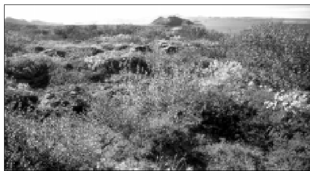
Figure 4. Original shrub landscape in southwestern Iceland.

The Kyoto Protocol has no provisions to account for decline in forest quality, and so it may not be fully reflected in an industrialised country's carbon accounting framework. The Intergovernmental Panel on Climate Change (IPCC) is now developing definitions and a methodology for reporting on emissions from forest degradation. Governments will consider adopting these options in 2003.