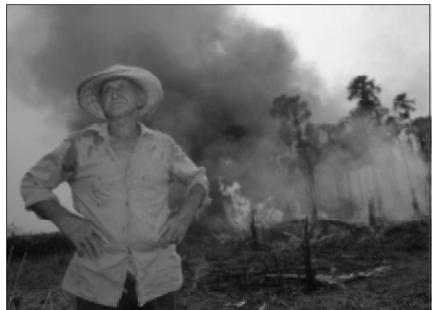
Figure 5. Forest set alight by farmer burning his land in preparation for planting, Roraima, Brazil.

It has been argued that agricultural intensification can benefit biodiversity in some settings by reducing the demand for agricultural land elsewhere. Others point out, however, that the associated biodiversity benefit from agricultural intensification practices is very difficult to determine given the array of factors that drive land use and change in land use. Strategies to increase biomass through agricultural intensification need to be planned and executed with great attention to local conditions and should be targeted to appropriate areas. Organic farming and other agricultural systems that support biodiversity may provide direction (European Conservation Agricultural Federation 1999).