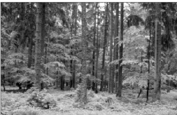
Figure 3. Mixed forest along the Golden Trail in Sumava National Park, Czech Republic.

The social implications of afforestation and reforestation activities will tend to be more prominent in developing countries. One of the main concerns is that land-use change, as may be required for development, will become too constrained if large tracts of land are locked up in contracts for carbon sequestration. In addition, for many communities the previous form of land use (e.g. cattle ranching) might provide more income. These issues are discussed in more detail in Section 2.