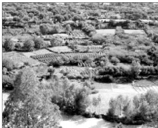
Figure 10. Agro-forestry in the Atlas Mountains, Morocco.

munities or enhance forest biodiversity. Careful review is necessary to determine who benefits from projects and how those benefits are distributed. CDM projects will not necessarily ensure social, economic or environmental improvements.