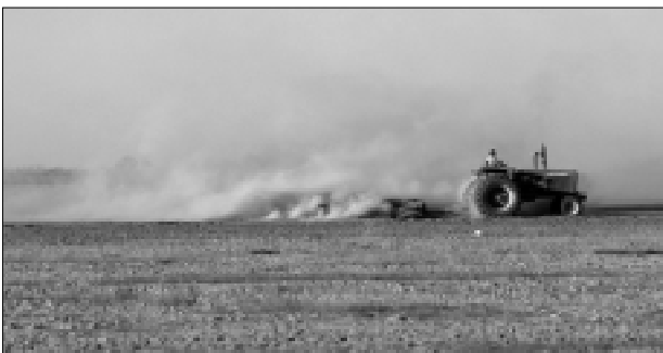
Figure 6. Intensive agriculture along the Gulf of California, Mexico, is causing serious soil erosion in some areas.

Terracing, use of "shelter belts" and other measures that reduce wind and water erosion benefit the land's long-term productivity. This creates increased