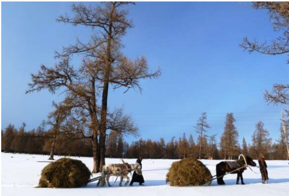
Sleighs carrying hay in Khuvsgul aimag, Mongolia, March 2012.