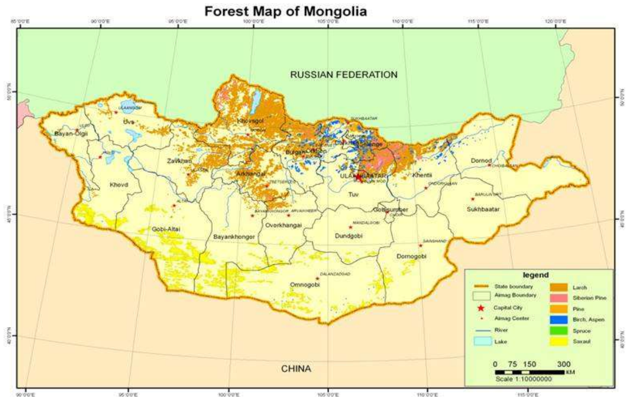
Figure 1: Forest map on Mongolia, prepared by Forestry Agency, Ulaanbaatar

1 below shows the distribution of Mongolia's forest areas.