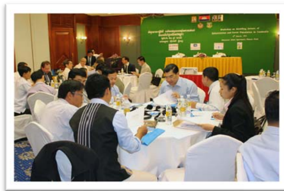
Workshop on Identifying Drivers of Deforestation and Forest Degradation in Cambodia