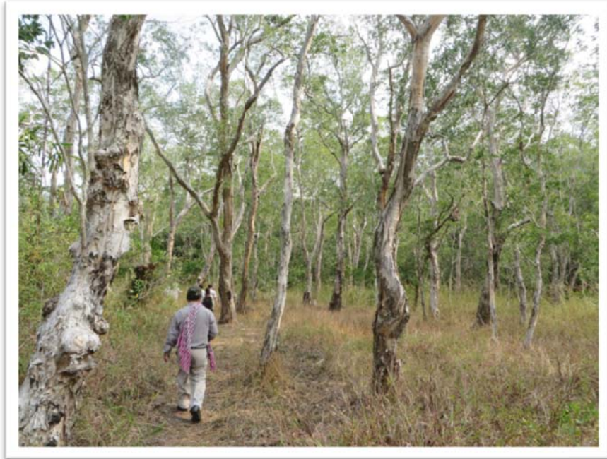
The officials walk through the forest as part of their field day visit in the rear mangrove forest in Koh Kong province, Cambodia.