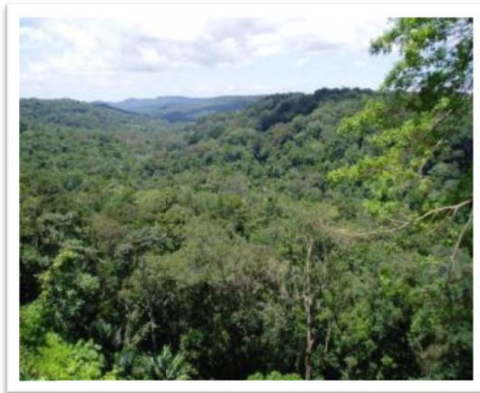
Forest Cover in Cambodia