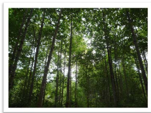
Forest in Cambodia

2 To be developed by the secretariat as referred to in paragraph 10 of this decision.