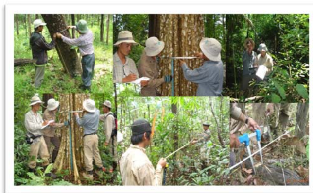
Forest Inventory in Seima, Mondulkiri province