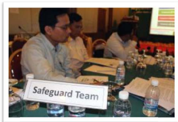
Safeguard Technical Team Meeting

1. Complete here means the provision of information that allows for the reconstruction of forest reference emission levels and/or forest reference levels.