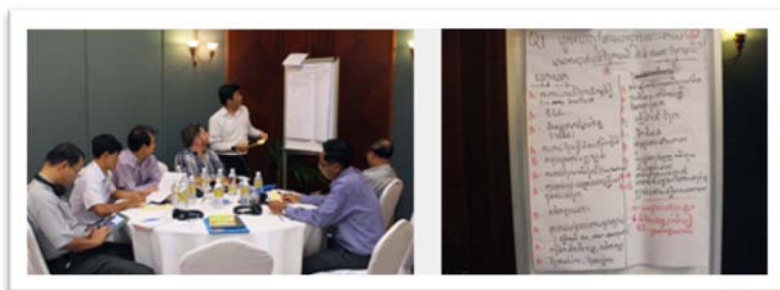
One of groups discussion to identify causes of deforestation and forest degradation in Cambodia

2. As agreed by the Conference of the Parties