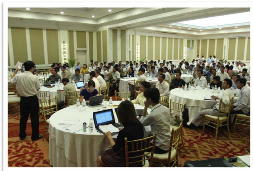
Consultation Group Selection Process in Cambodia