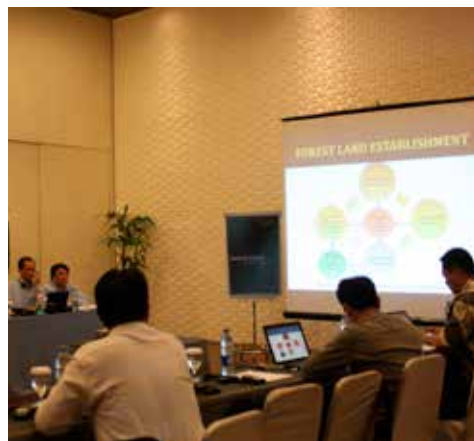
Exchange of experience in Jambi, Indonesia