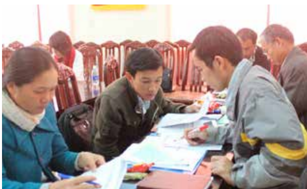
Team work on the indicators