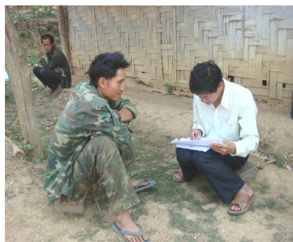
Photo 4: Provincial officer from the Oudomxay Department of Planning supports data collection