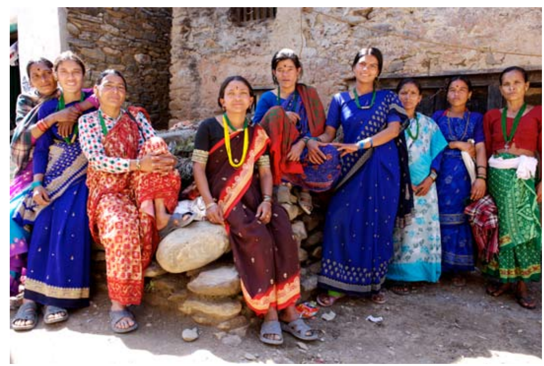
PETER BRUYNEEL / UNFPA