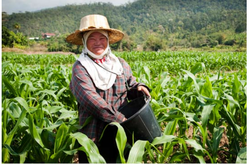
TAI POWER SEEFE