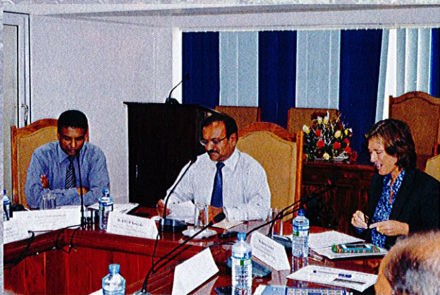
3 rd PEB Meeting is in progress

United Nations Environment Programme (UNEP)