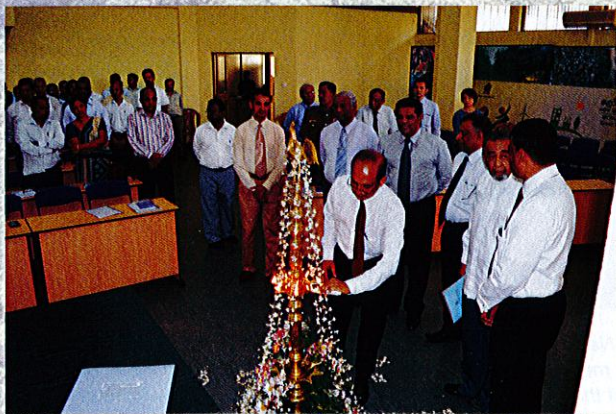
International Day of Forests Commemoration 2014