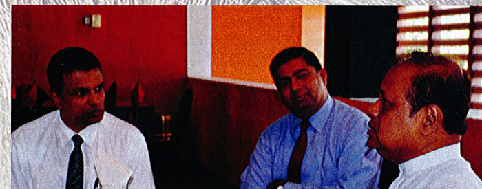
National Programme Director and the National Programme Manager meet with the Hon. Minister of Environment and Renewable Energy at the Forest Department's Extension and Communications Workshop.

The UN-REDD Programme helps countries to engage all relevant stakeholders in the development and implementation of national REDD+ strategies and develop capacities to effectively implement REDD+.