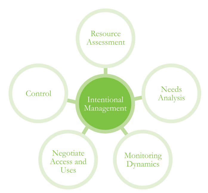
Figure 3: Components of intentional management of local resources. Unless the communities are directly involved in all five components, chances are that participatory monitoring will fail in the short term. Adapted from Garcia and Lescuyer (2008).

in many cases, decision-making has not truly been devolved to communities while other more powerful stakeholders continue to exercise control. Therefore, if the community has not received full rights and authority over its forest, participatory monitoring remains divorced from decision-making with little possibility of influencing management. The authors thus introduce the concept of "intentional management" (Figure 3), which occurs when a community formally convenes and makes decisions about management objectives and community needs. The community must be involved in all aspects of the five main elements of intentional management: resource assessment, control, needs analysis, monitoring dynamics and negotiation of access and uses.