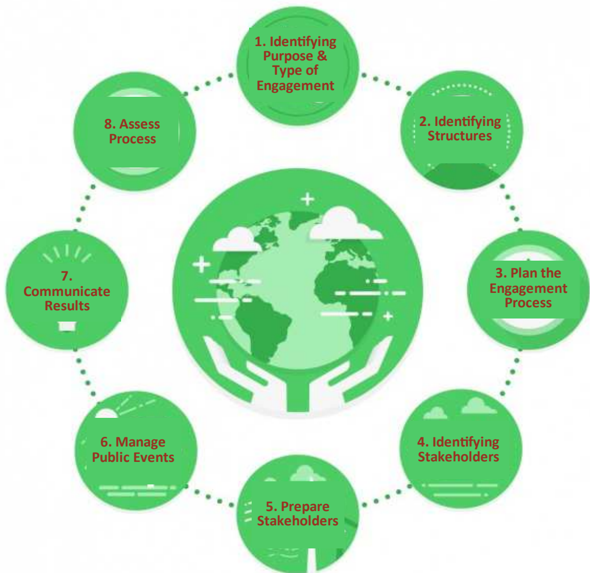
Figure 3: Designing and Implementing a Stakeholder Engagement Process

While these 8 steps provide a working framework for designing and implementing stakeholder engagement, the reality of engagement is that flexibility in response to actual situations is needed. Such flexibility may require steps to be repeated (e.g. if knowledge levels are too low) or redesigned (e.g. if mistrust levels are too high). Some engagement may conclude after step #8 (such as may apply for a local consultation, for example), while more complex engagement will require some steps to be repeated. An engagement to design a national REDD+ strategy, for example, will require multiple events, ongoing process evaluation and the treatment of dissent and grievances.