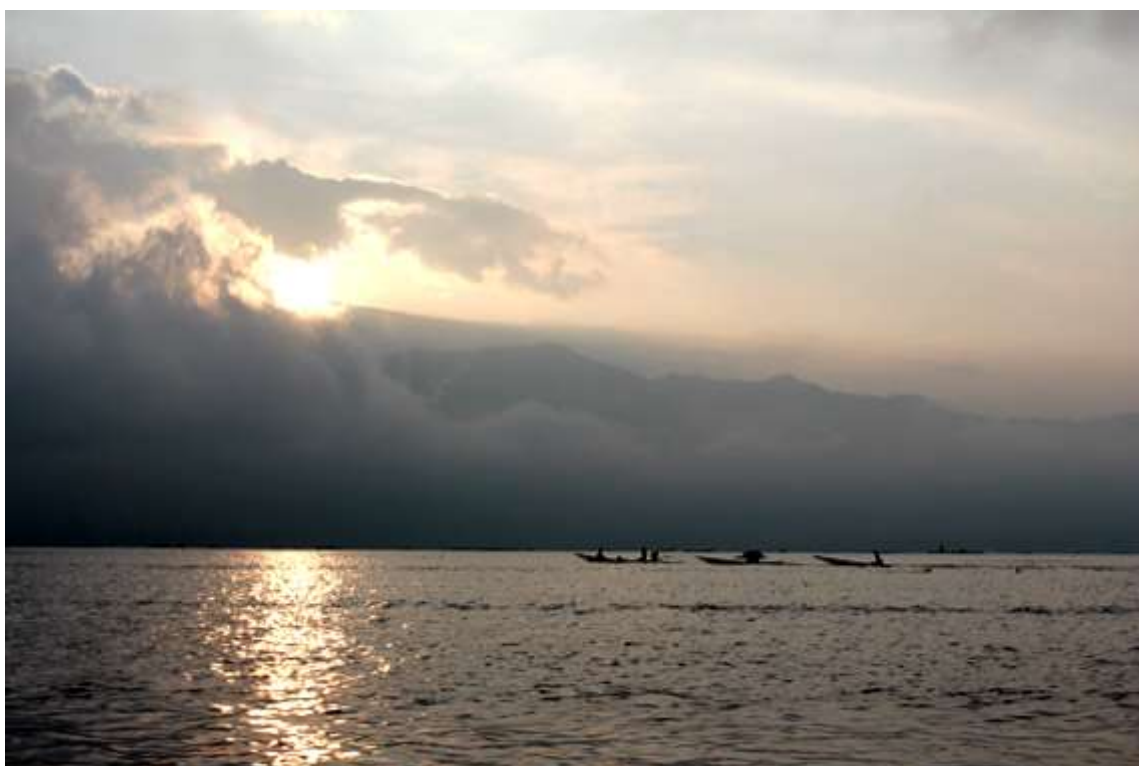
Inle Lake, the second largest lake in Myanmar, is a freshwater lake located in the Nyaungshwe Township of Taunggyi District of Shan State. Inle Lake is suffering from environmental impacts associated with agricultural activities within the wetlands and surrounding hills of the lake, and some other factors.