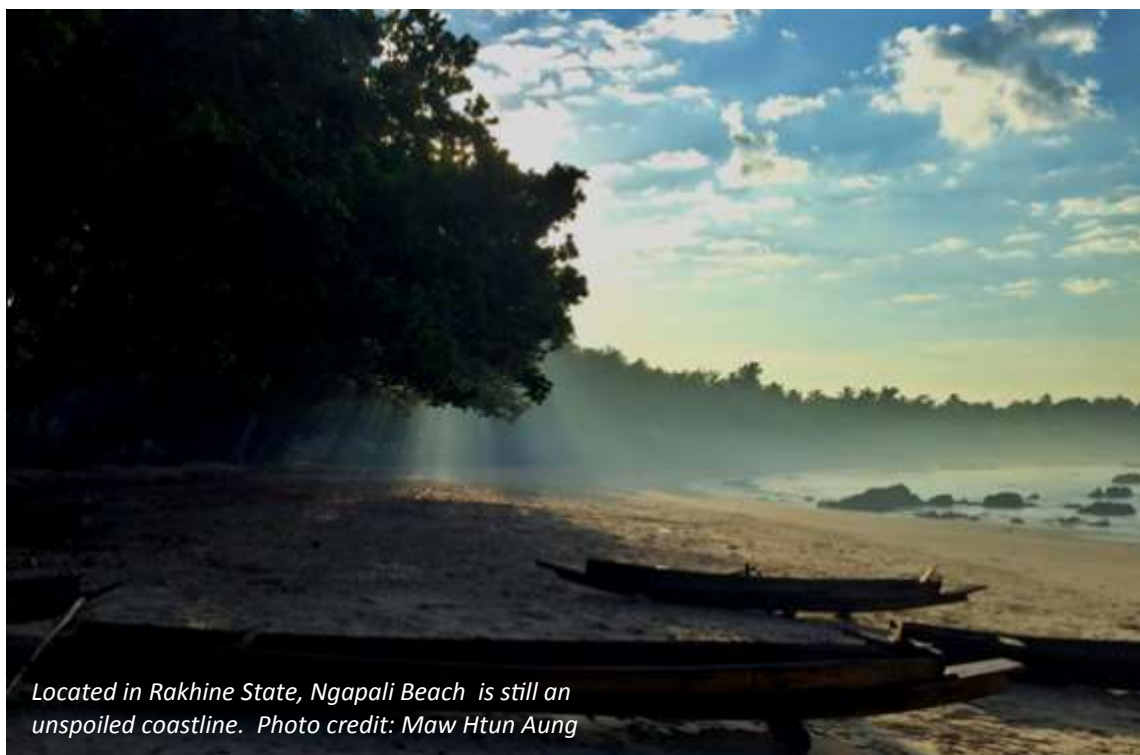
Located in Rakhine State, Ngapali Beach is still an unspoiled coastline.

As the word “encourages” suggests, this is not mandatory for countries but helpful to consider when developing the summary of information on how the safeguards have been addressed and respected. Finally the decision concludes the discussions on guidance for safeguards information systems under SBSTA by stating that there is no further need for additional guidance.