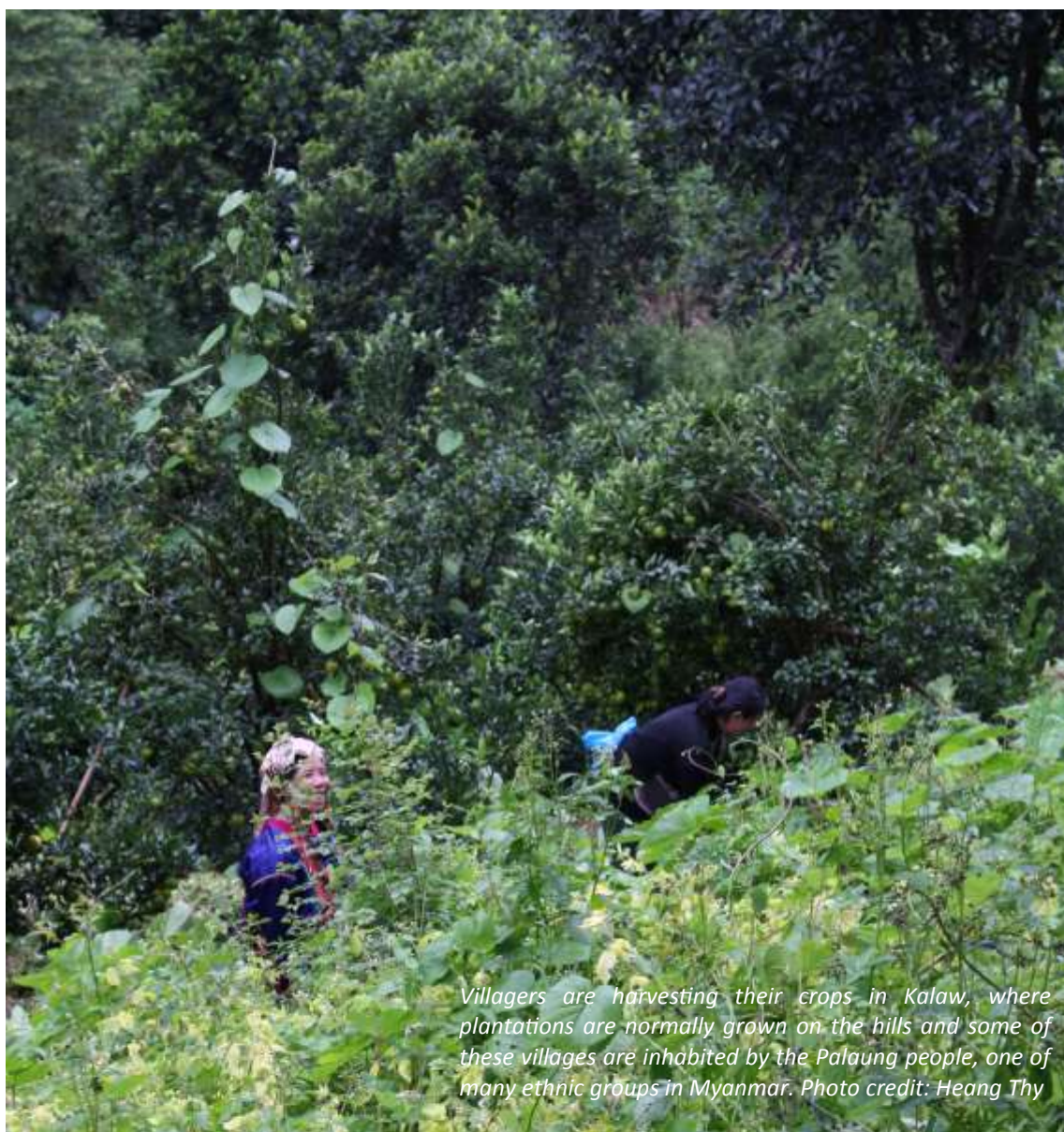
Villagers are harvesting their crops in Kalaw, where plantations are normally grown on the hills and some of these villages are inhabited by the Palaung people, one of many ethnic groups in Myanmar.

The adoption of the Paris Agreement in December 2015 highlighted the importance of REDD+ and the need for adequate and predictable financial resources.