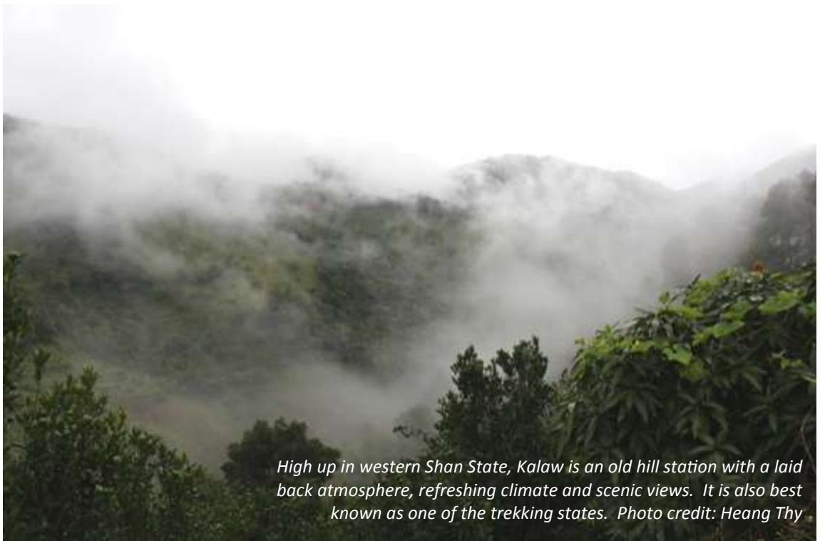
High up in western Shan State, Kalaw is an old hill station with a laid back atmosphere, refreshing climate and scenic views. It is also best known as one of the trekking states.