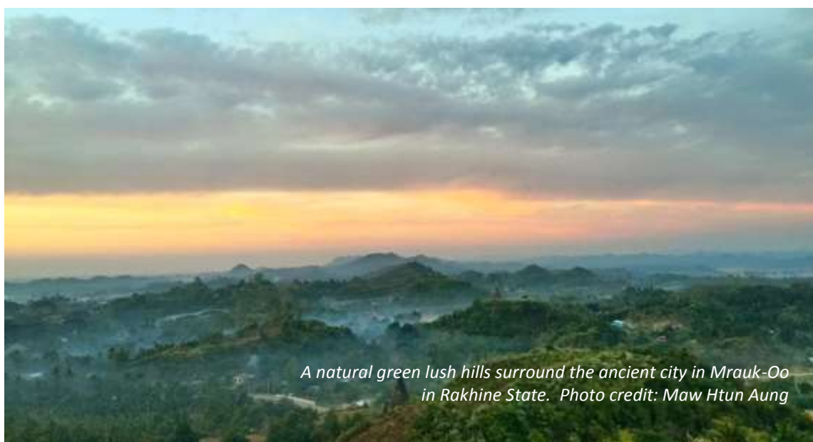
A natural green lush hills surround the ancient city in Mrauk-Oo in Rakhine State.

The decision also mentions that forest reference emission levels and forest reference levels should be established in a transparent manner, taking into account historic data, adjusted for national circumstances, in accordance with relevant decisions of the COP. This latter part is important since we have a reference back to this in decision 12/CP.17, see below on how modalities for establishing reference levels.