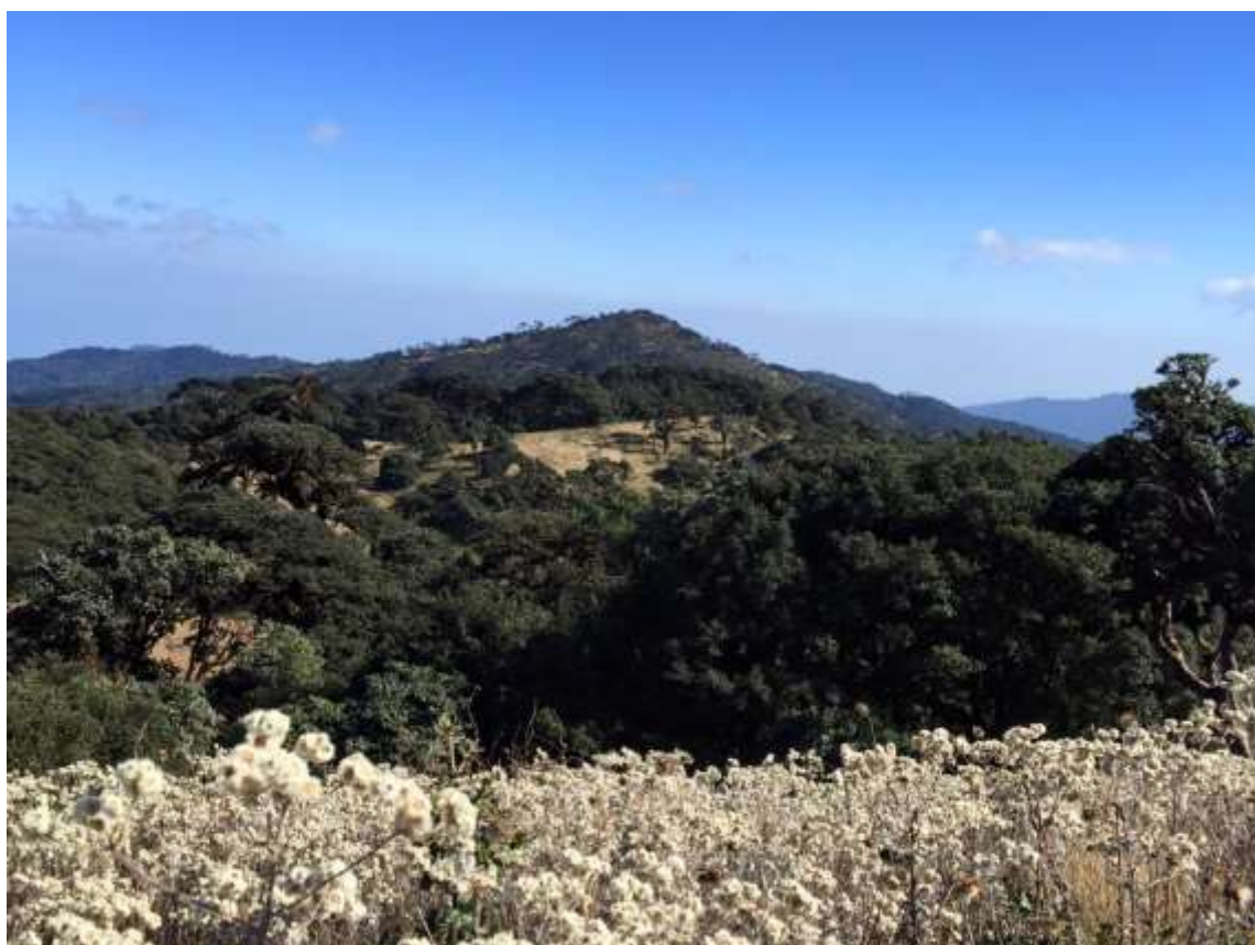
Standing at around 3,000 meters, Mount Victoria is the tallest peak in mountainous Chin State and the third highest in Myanmar overall.

The decision further states that those countries pursuing such approaches may consider developing a national strategy or action plan, identify support needs, demonstrate how it contribute to the five REDD+ activities and encourages countries to share information via the web platform on the UNFCCC website. This decision concludes the discussion of this agenda item.