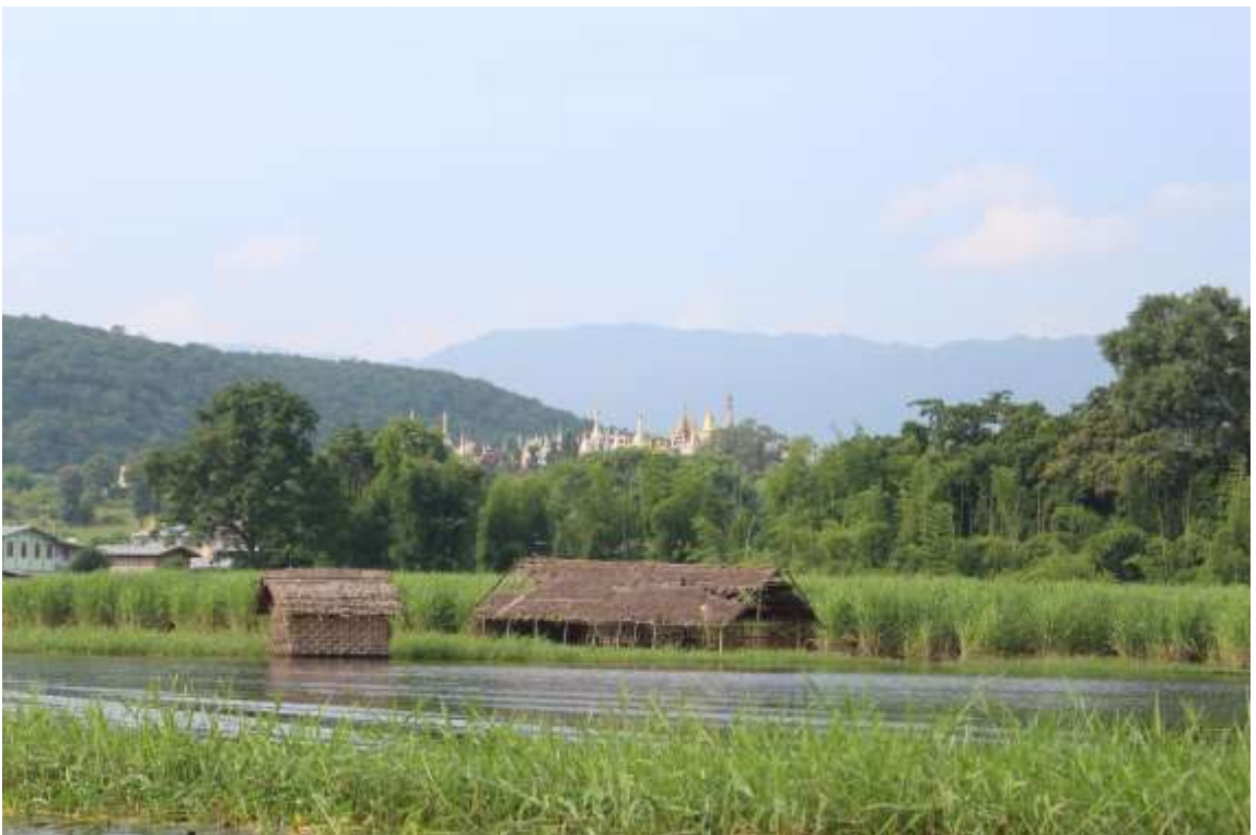
Surrounded by forest mountains, Inle Lake is also well known as one of floating farm village communities — each farmland is attached to the lake bottom by bamboo poles. The native people, In-Thars, grow vegetables on floating islands which are a collection of floating weed and water hyacinth.

8. Decides that there is no need for further guidance pursuant to decision 12/CP.17, paragraph 6, to ensure transparency, consistency, comprehensiveness and effectiveness when informing on how all the safeguards are being addressed and respected.