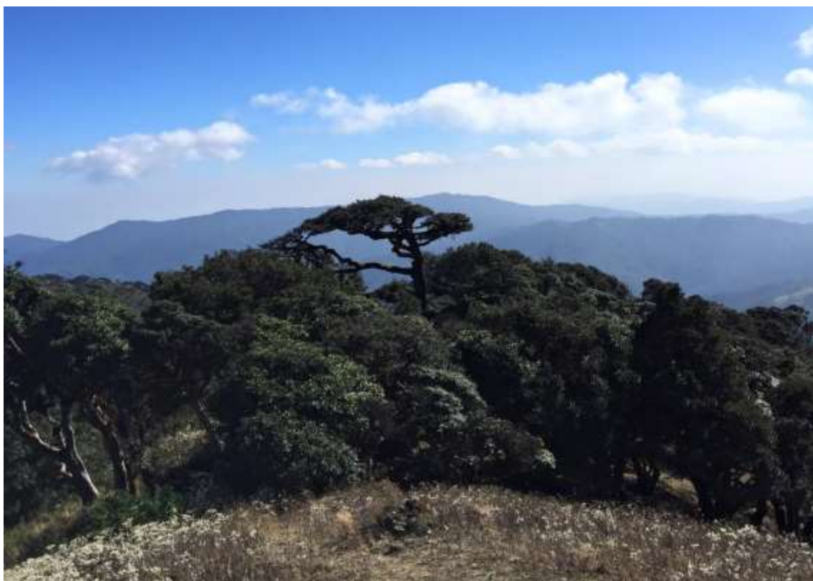
Mt Victoria in Southern Chin State offers stunning views, highland cultures and traditions of hill-tribe peoples. The mountain is now protected within Nat Ma Taung National Park.

Furthermore the national forest monitoring systems should be built on existing systems, be flexible and allow for improvements and enable the assessment of different types of forest in the country, including natural forests, as defined by each Party. It is also acknowledged that national forest monitoring systems could be useful for providing information on the safeguards.