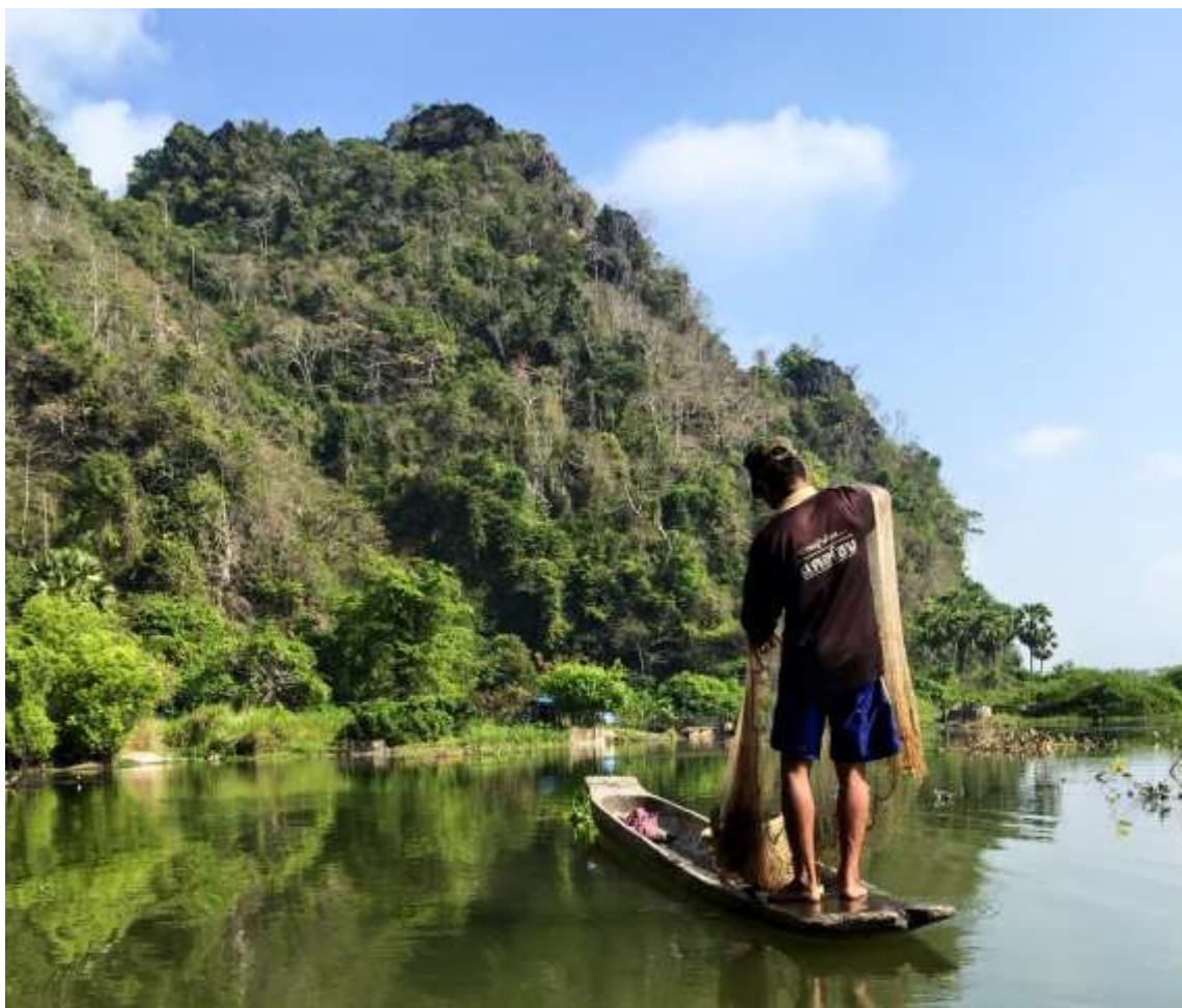
A local fisherfolk is about to cast nets in Saddan Cave area, in Karen State.

This is a process-oriented decision. It established a work programme on market-based approaches mentioned in decision 2/CP.17 and a process on coordination of support for all the REDD+ activities; and a request to SBSTA to work on how non-market-based approaches could be developed, and on methodological issues related to non-carbon benefits.