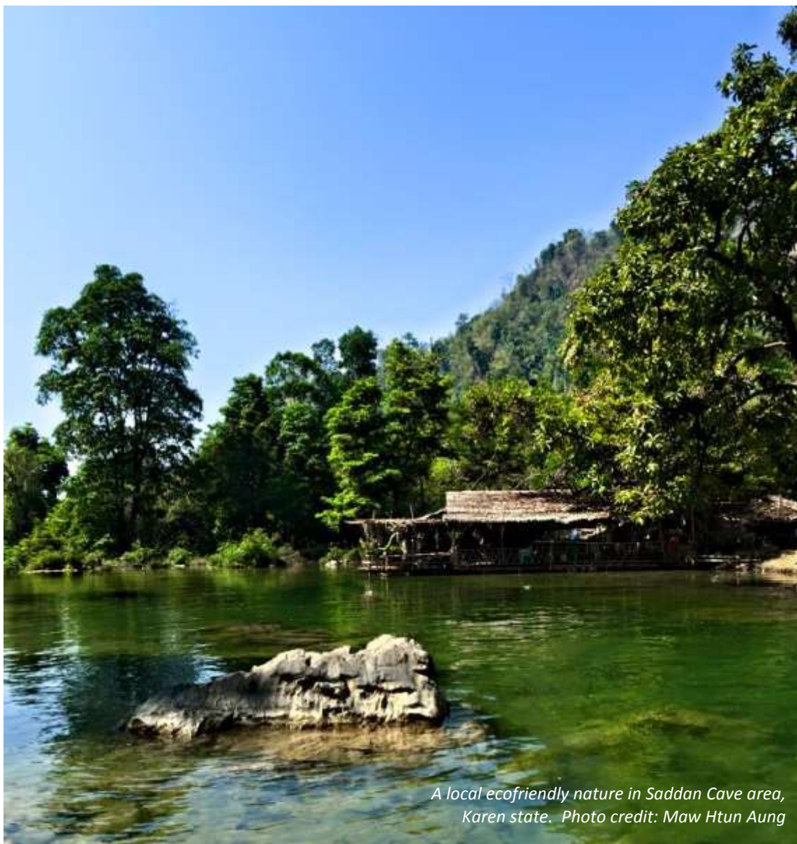
A local ecofriendly nature in Saddan Cave area, Karen state.

The difference between REL and RL has never been clarified in any decision but a common understanding has been that REL refers only to activities that reduce emissions from deforestation and forest degradation, while RL includes emissions and removals and can include removals from the three “+ activities” of REDD+ that enhance forest carbon stocks.