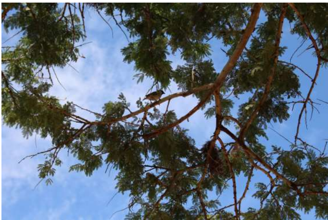
Birds are playing on a tree in Bagan.

1 Taking note of, if appropriate, the guidance on consistent representation of land in the Intergovernmental Panel on Climate Change Good Practice Guidance for Land Use, Land-Use Change and Forestry