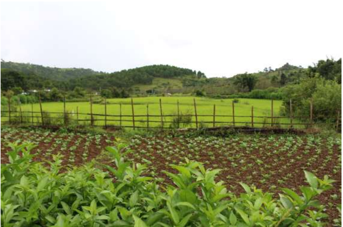
Kalaw, from plantations to hiking destination to see amid gnarled pines, bamboo groves, and rugged mountain scene.