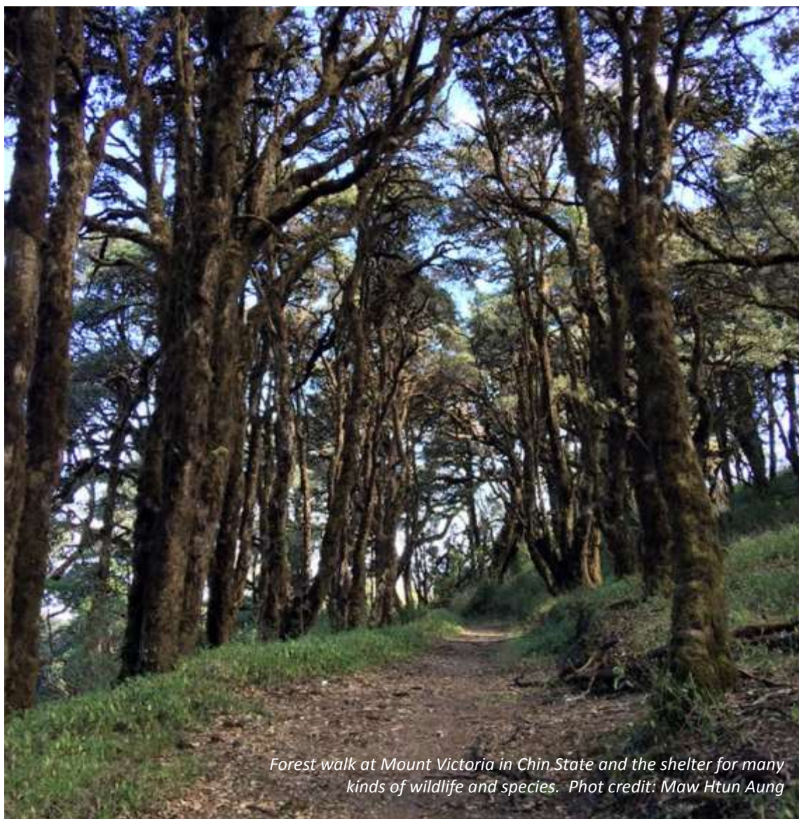
Forest walk at Mount Victoria in Chin State and the shelter for many kinds of wildlife and species.

The decision concludes that non-carbon benefits are not a requirement for results-based payments but recognizes the importance of non-carbon benefits and encourages countries to share information on non-carbon benefits via the web platform on the UNFCCC website. This concludes the agenda item on non-carbon benefits.