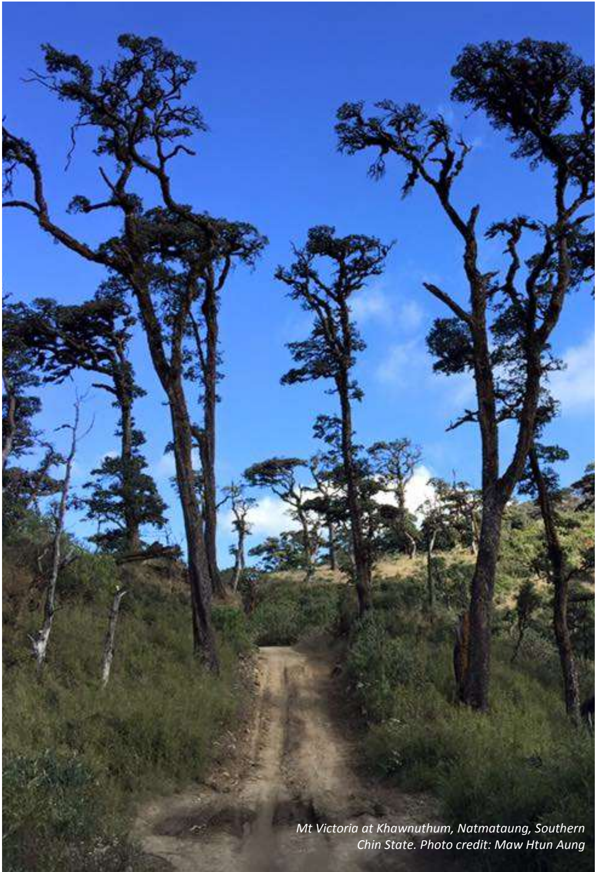
Mt Victoria at Khawnuthum, Natmataung, Southern Chin State.