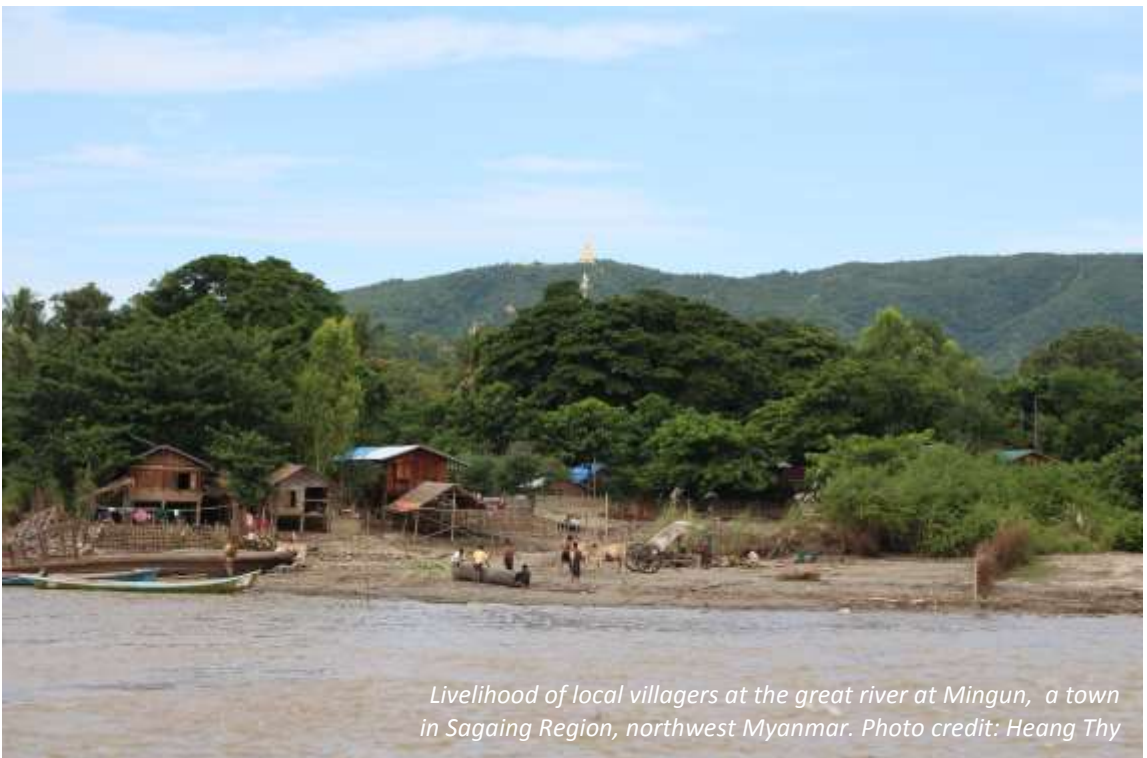
Livelihood of local villagers at the great river at Mingun, a town in Sagaing Region, northwest Myanmar.

2 To be developed by the secretariat as referred to in paragraph 10 of this decision.