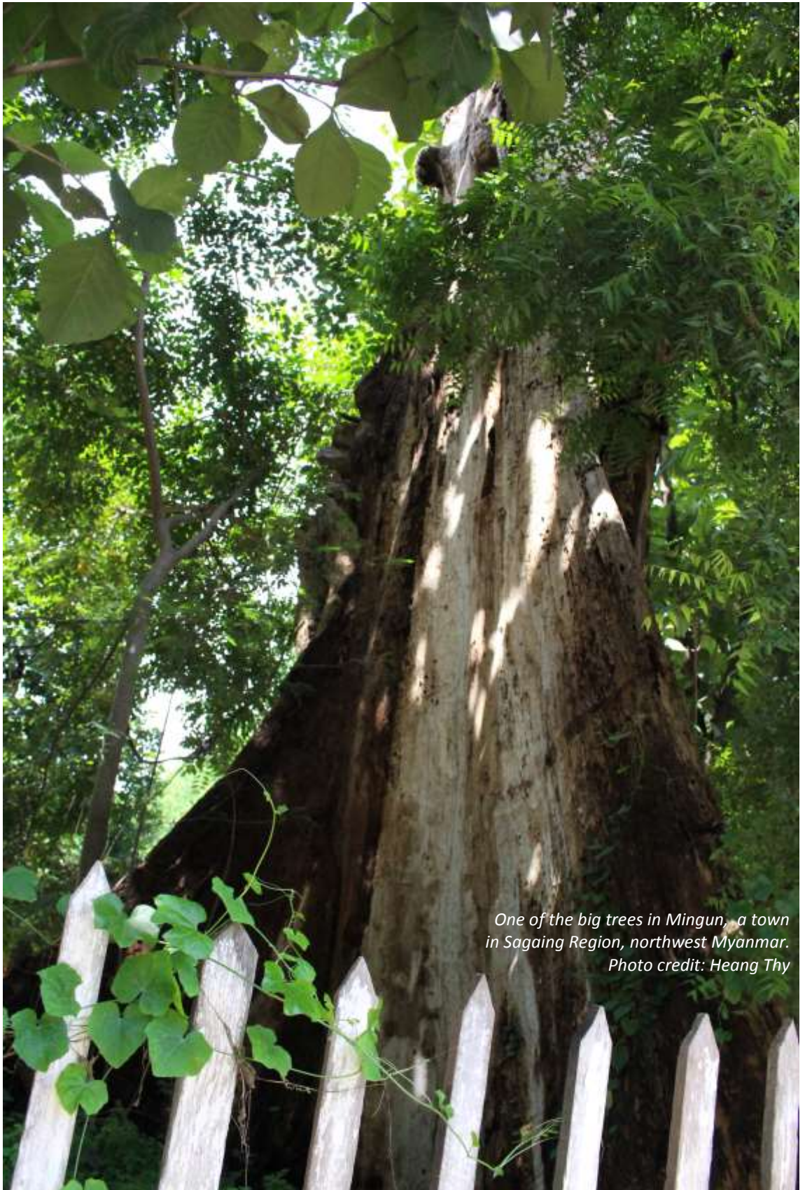
One of the big trees in Mingun, a town in Sagaing Region, northwest Myanmar.