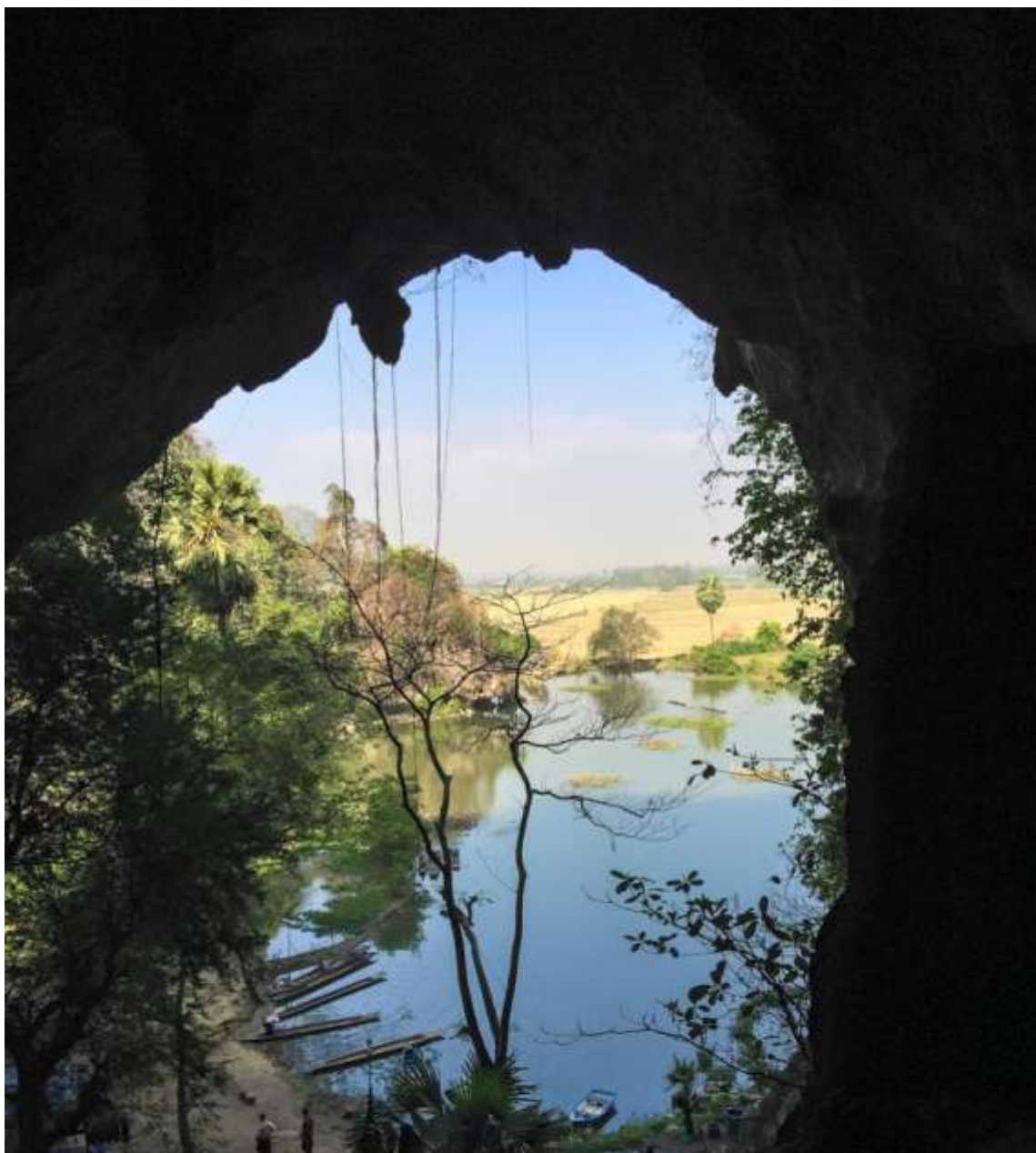
Saddan Cave is a well known temple site southeast of Hpa An in Kayin State.

1 As per decision 1/CP.16, paragraph 70, Parties undertake activities as deemed appropriate by each Party with their respective capabilities and national circumstances, noting that significant pools and/or activities should not be excluded.