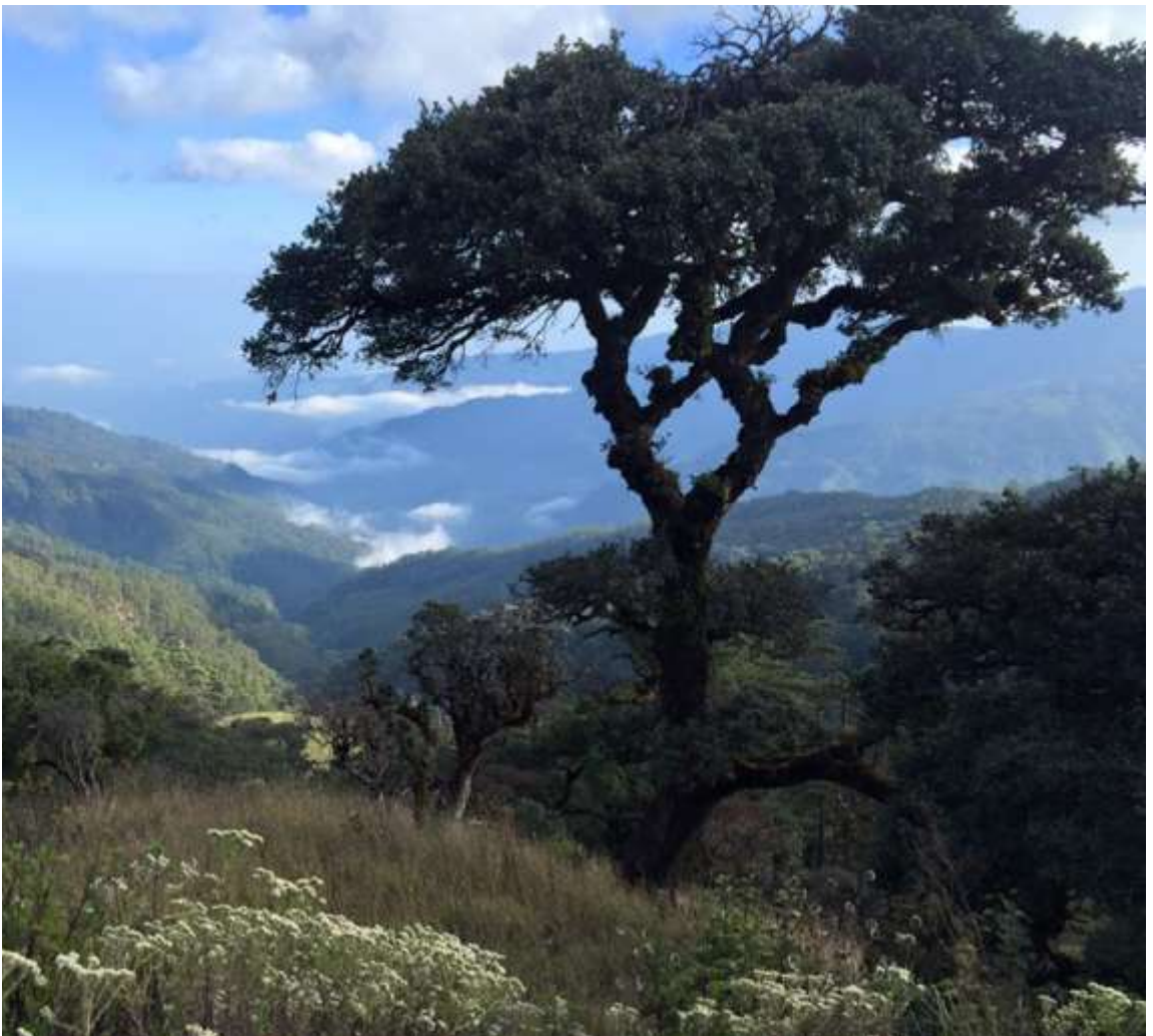
Mount Victoria at Khawnuthum in Natmataung, Southern Chin State.

This main importance of this decision is to clarify that the seven safeguards will apply regardless of the source of financing, and that appropriate market-based approaches to support results-based actions, as well as non-market-based approaches could be developed. This decision also requests for further work on the financing of results-based actions.