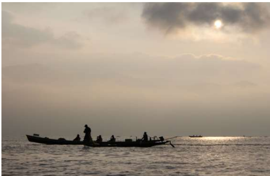
Villagers fishing to support their families at Inle Lake, the second largest lake in Myanmar.